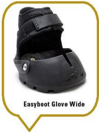
Easyboot Glove Wide

The new WIDE GLOVE is here! Plus the WIDE Glue on Shells.