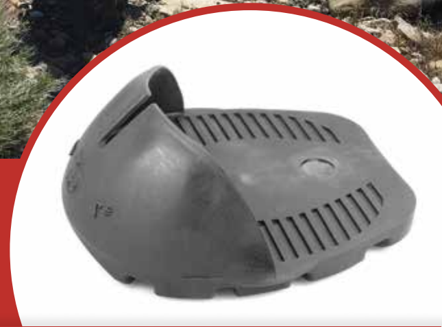
THE FLIP FLOP